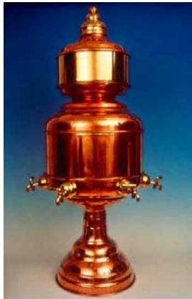
The original Temple Institute laver.

The laver is the first vessel to be used by the priests each day in the Holy Temple. At dawn each day the cohanim sanctify their hands and feet from its water.